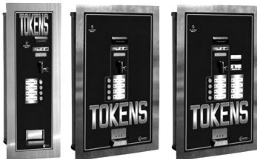
(L to R): Standard's Credit Card-to-Tokens Changers: MC315RL-CC (credit card only), MC525RL-CC (credit card only), MC535RL-CC (credit card and cash)

Montreal, Quebec: 6020 Van DenAbeelee St. Laurent, QC H4S 1R9 Canada Phone: 514-332-2196 Fax: 514-332-3963