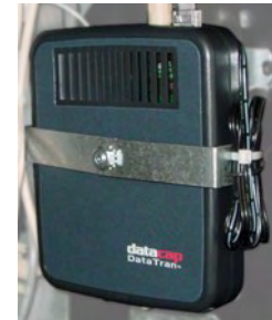
DataTran 162SL POS Terminal Device ("black box")

2. DIAL-UP vs. HIGH SPEED COMMUNICATION -- At this same time, you will need to determine if you want a DIAL-UP or HIGH SPEED (Cable modem, DSL, T1, etc.) connection. The Dial-Up connection uses a dedicated phone line that must be run to the machine. In this case you will connect your phone line into the DataTran 162SL POS Terminal Device (black box located inside the change machine).